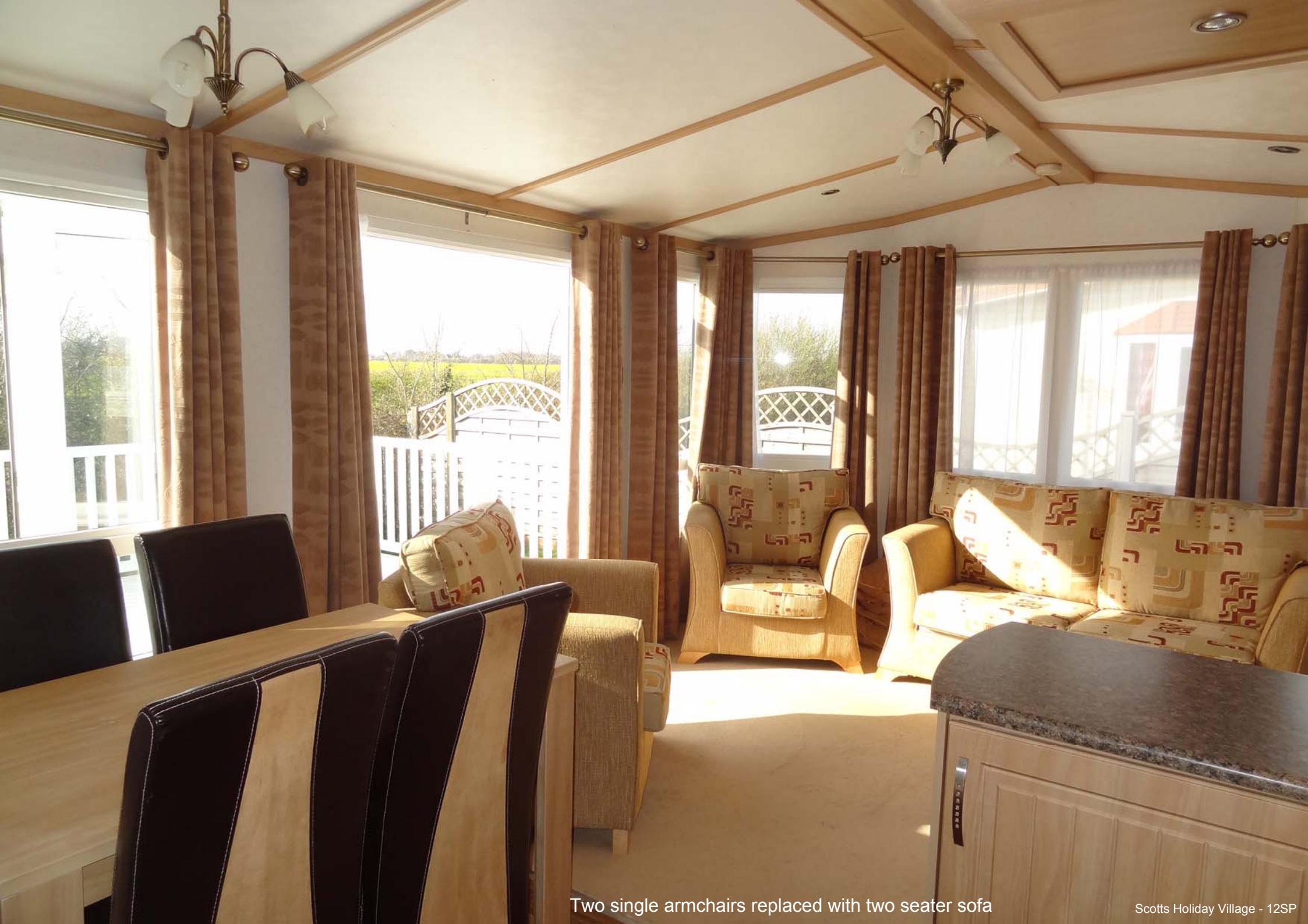
Two single armchairs replaced with two seater sofa