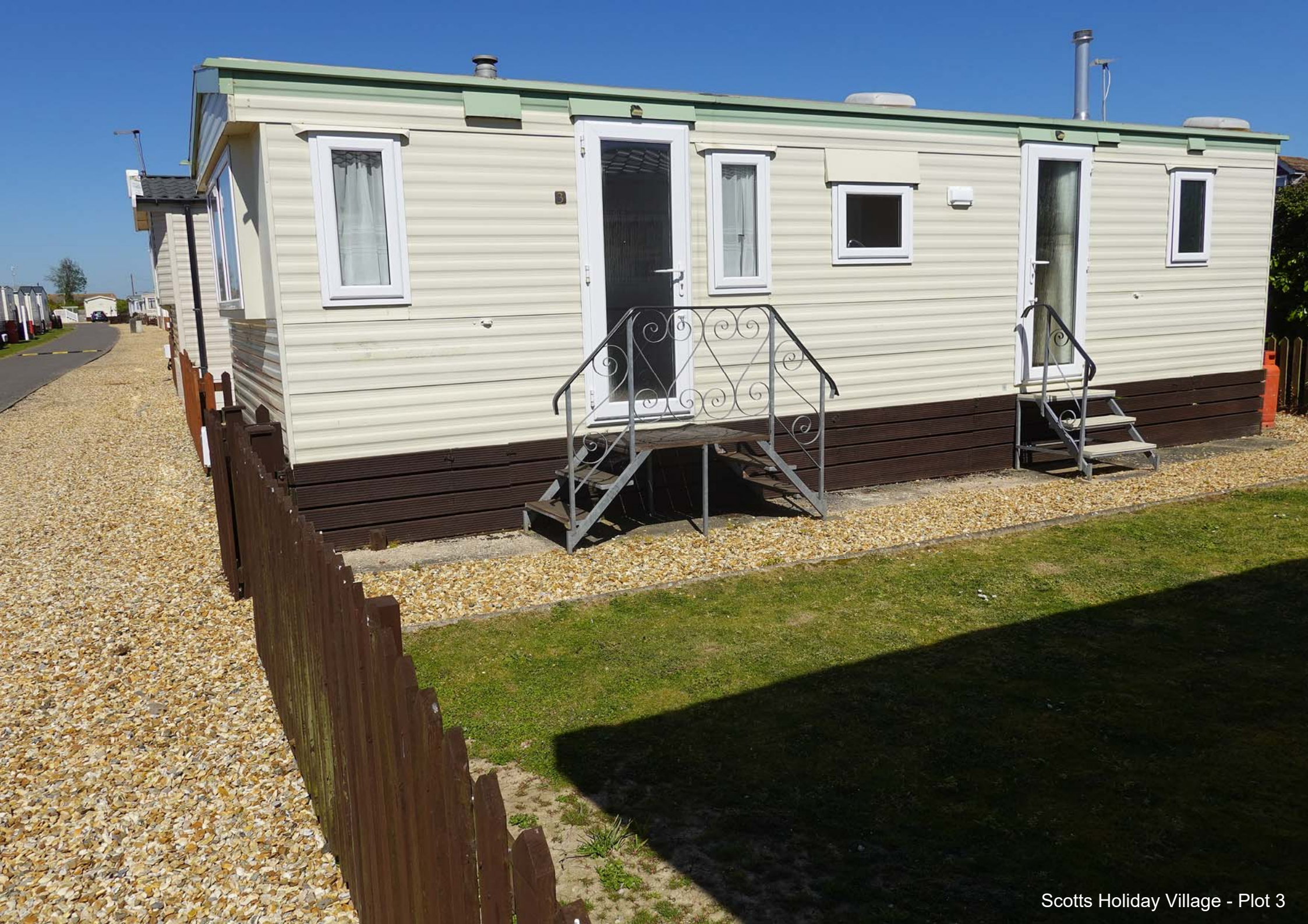
Scotts Holiday Village - Plot 3