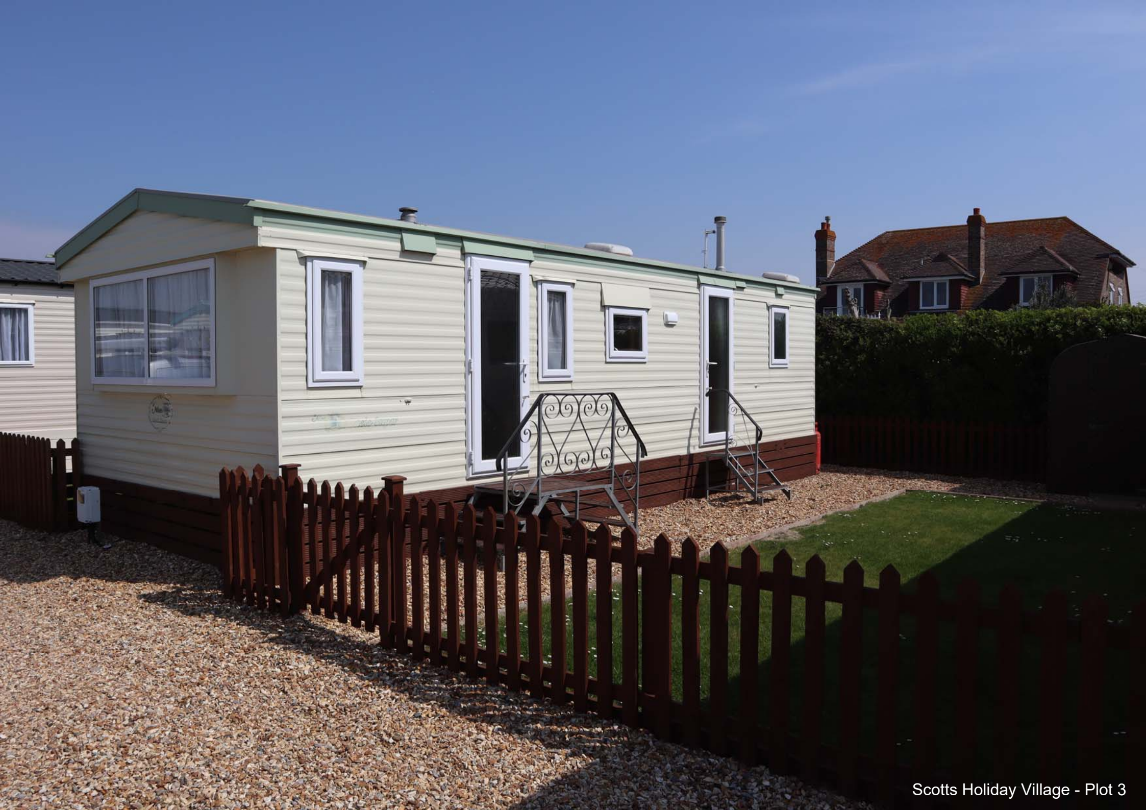
Scotts Holiday Village - Plot 3