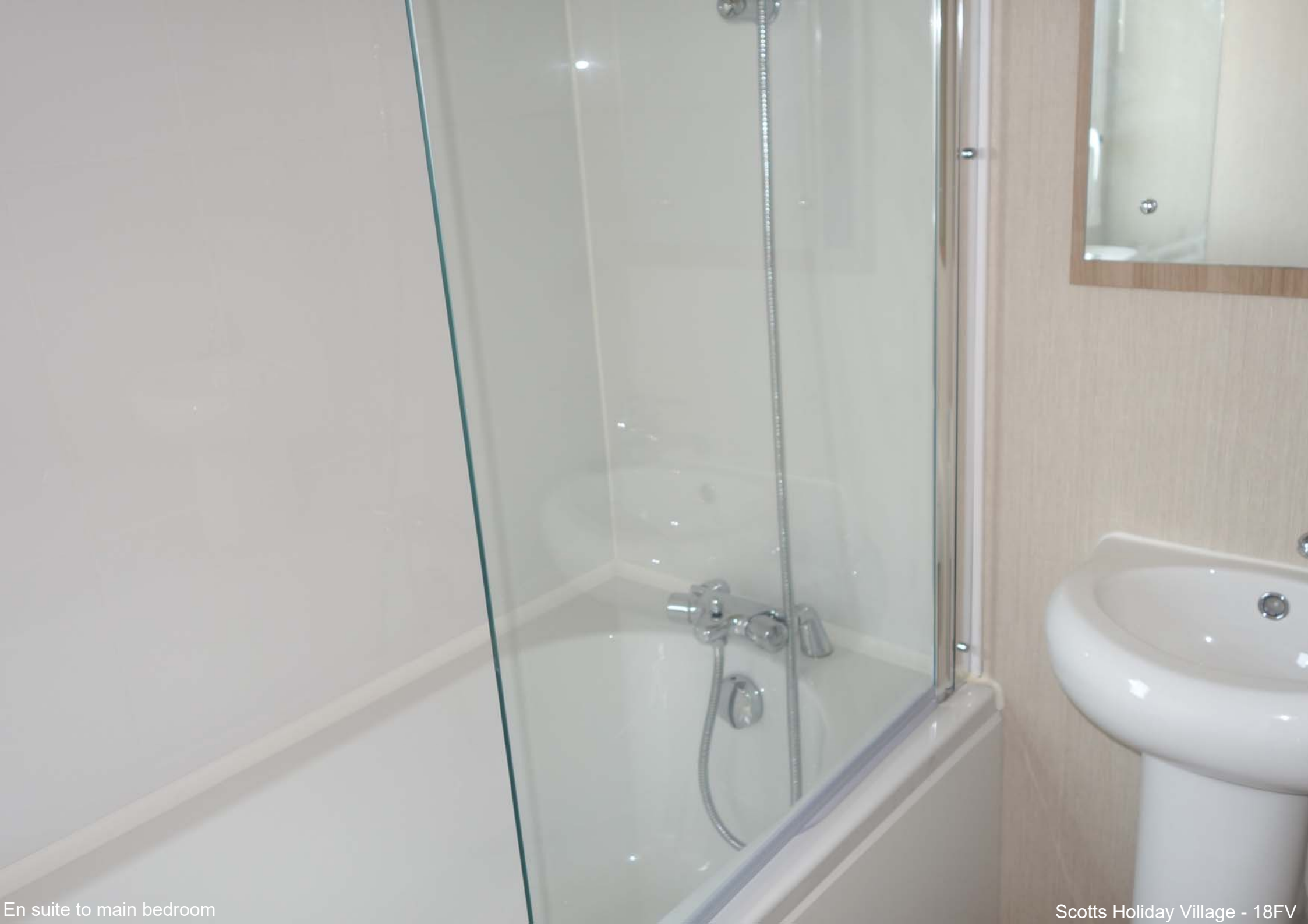
En suite to main bedroom